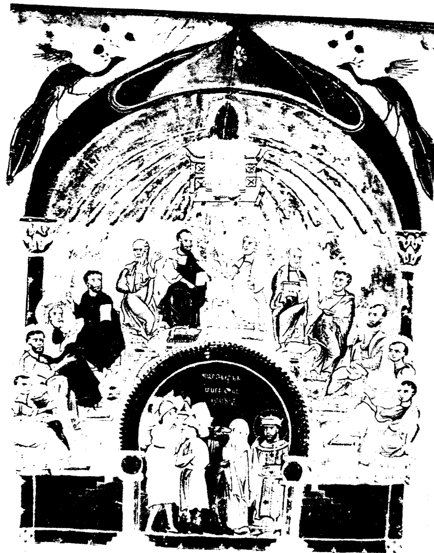
Fig. 1. Pentecost, 1261, Hromkla, Toros Roslin. Baltimore, Walters Art Gallery, MS 539, f. 379.