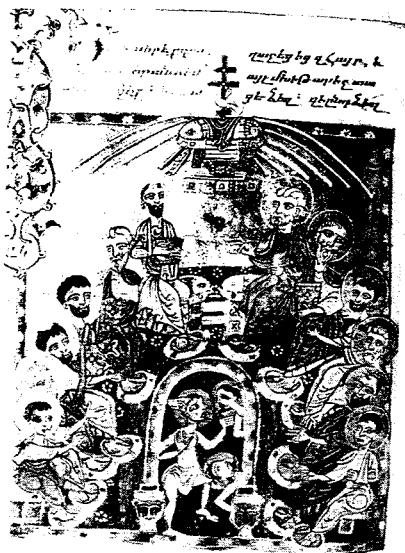
Fig. 3. Pentecost, 1223, Mamistra. Istanbul, Galata, MS 35, f. 253v.