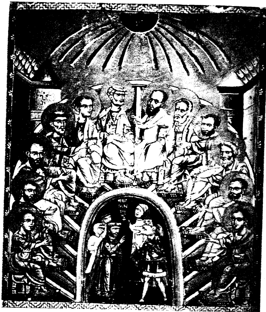
Fig. 4. Pentecost, 1267–8, Hromkla, T'oros Roslin. Erevan, Matenadaran, MS 10675, f. 305.