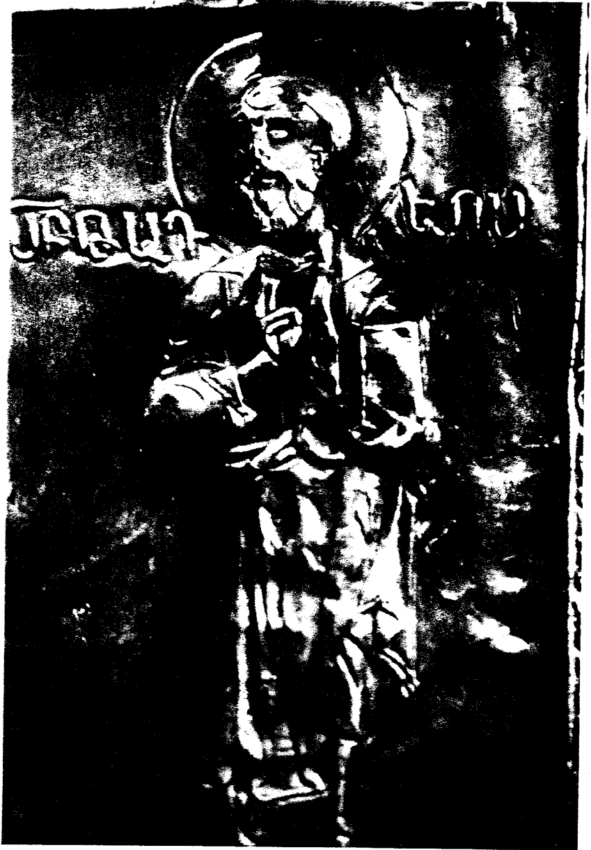
Fig. 7. St. Thaddaeus, reliquary of 1293, Cilicia. St. Petersburg, Hermitage Museum.