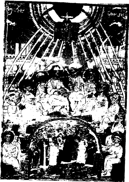
Fig. 2. Pentecost, circa 1060. Erevan, Matenadaran, MS 7736, f. 21.