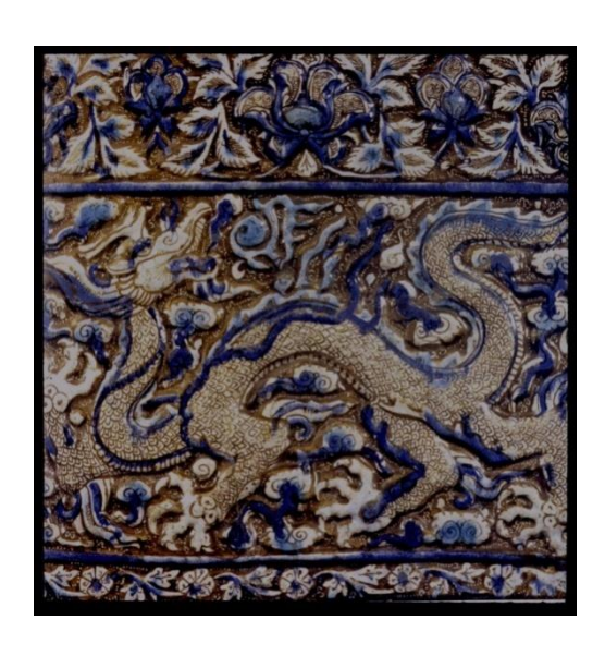
Fig.5 Frieze tile with dragon, Takht-i Sulaymān, 1270s. London, Victoria and Albert Museum, (541–1900). Photo after Komaroff and Carboni, Legacy of Genghis Khan , fig. 100.

Fig.6 Bronze mirror with dragon and phoenix. Xuanhua, Hebei, China, tomb M10, pre–1093. Excavation Report Xuanhua, 2003, vol. I, 49.