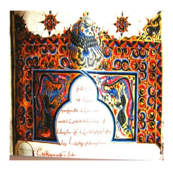
Fig. 2. Headpiece with dragon and phoenix motif, detail. Erevan, Matenadaran, M979, Lectionary of Het'um II, 1286, fol. 334.