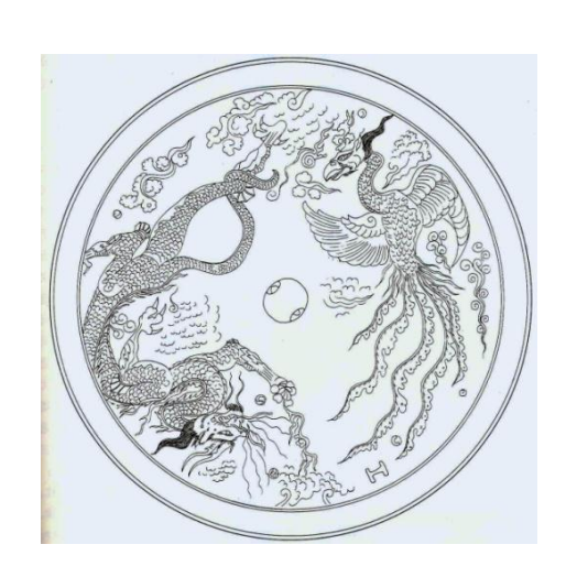
Fig.6 Bronze mirror with dragon and phoenix. Xuanhua, Hebei, China, tomb M10, pre–1093. Excavation Report Xuanhua, 2003, vol. I, 49.