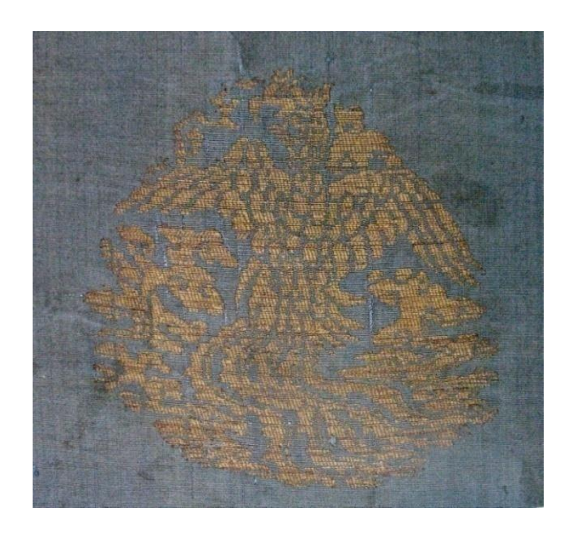
Fig.4 Cleveland Museum of Art, John L. Severance Fund (1994.292), tabby, brocade, gold thread on a blue green ground with rows of phoenixes facing right and left. Watt and Wardwell, When Silk Was Gold , no. 31, 118–119;